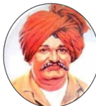
Chatrapati Shahu Maharaj Jayanti Wednesday, 26 June