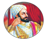
Chhatrapati Shivaji Maharaj Jayanti Wednesday, 19 February