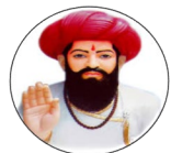
Sant Sevalal Maharaj Jayanti Saturday, 15 February