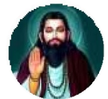
Sant Ravidas Maharaj Jayanti Monday, 24 February