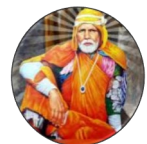
Sant Gadge Baba Jayanti Sunday, 23 February