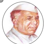
Yashwantrao Chavan Jayanti Wednesday, 12 March