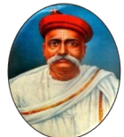
Lokmanya Tilak Jayanti Tuesday, 23 July

Holiday/S Ashadhi Ekadashi and Mohram Wednesday, 17 July