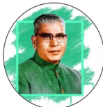
Vasant Rao Naik Jayanti Saturday, 13 July