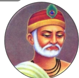
Kabir Jayanti Tuesday, 4 June

Special days Environment Day Wednesday 05 June